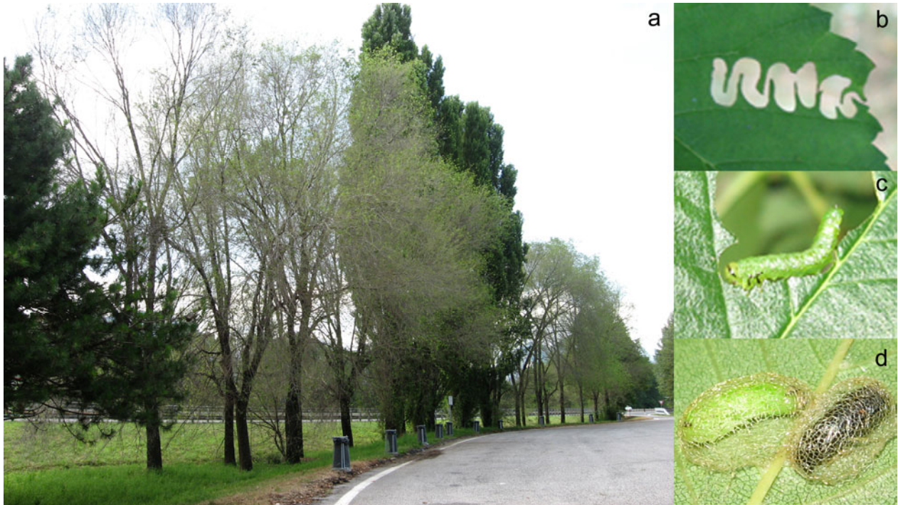
Figure 1. Elm trees completely defoliated by A. leucopoda larvae (parking area “Cormor Est”, Treppo Grande, Udine), summer 2009 (a); elm leaf with the zigzag feeding trace of a young A. leucopoda larva (b); larva of A. leucopoda feeding on an elm leaf (c); cocoons of A. leucopoda attached to the lower surface of an elm leaf (d). (In colour at www.bulletinofinsectology.org )

monitoring activities were carried out from April to November. A single site, already infested by A. leucopoda in 2009 (the parking area of Alpe-Adria A23 motorway called “Cormor Est”, Treppo Grande UD, at the north of Udine), was monitored every two weeks (April to September), all the others were visited once. The observations were carried out along roadsides, at the margins of groves and in urban areas. The elms were growing alone or in mixed arboreal vegetation.