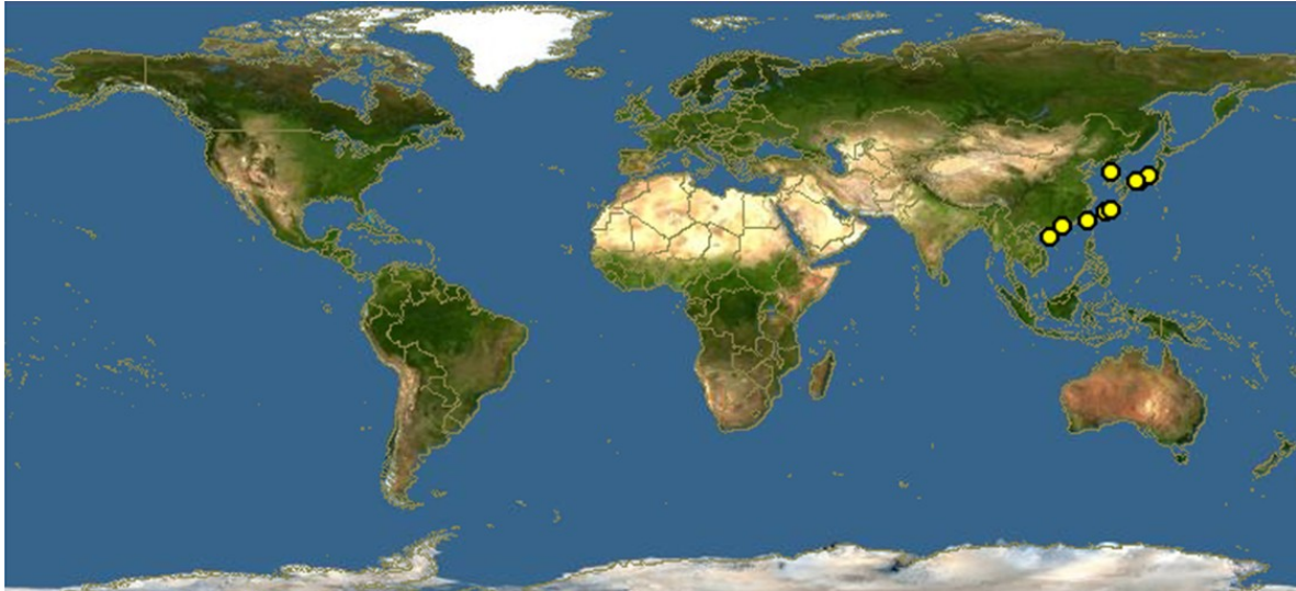
Figure 1. Records of M. disjunctiformis in its countries of origin (Ascher and Pickering, 2018).

Smith 1853 and an undetermined species of Megachile belonging to the biroi group (Ascher et al. , 2016). In all these species females are black with whitish hairs on the posterior thorax (propodeum) and anterior metasoma, and their wings are largely infuscated. Although they appear very similar in dorsal view, they differ in the colour of their scopal hairs, which are black, orange-red, and pale-yellow respectively. Males of M. disjuncta and Megachile sp. biroi group are very similar to each other and to conspecific females, while in M. conjuncta a clear sexual dimorphism exists, with males having a fulvous pubescence on head and thorax and fringes of fulvous hairs in the distal part of the tergites. The males of Megachile sp. biroi group can be distinguished from those of M. disjuncta by the black hairs on the pleuron below the wing bases and by the smaller and much denser tergal punctuation. Other diagnostic features can be found in male genitalia (Ascher et al. , 2016).