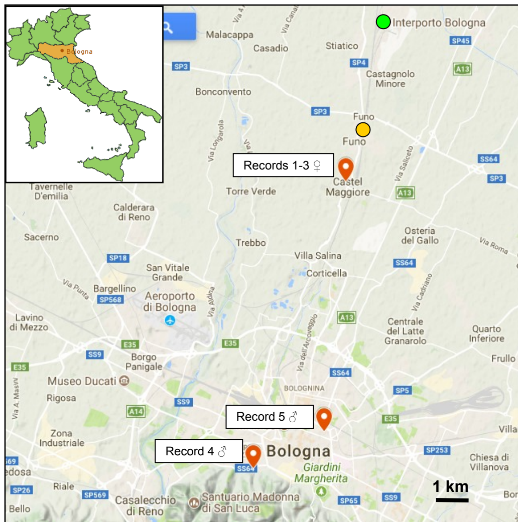
Figure 4. Maps of records of M. disjunctiformis . Records 1-3: 3 female specimens in 2011, 2016 and 2017; record 4: male specimen beginning September 2017; record 5: male specimen mid September 2017. The green dot represents the Bologna trade hub (Interporto), while the yellow one represents the wholesale commercial district.