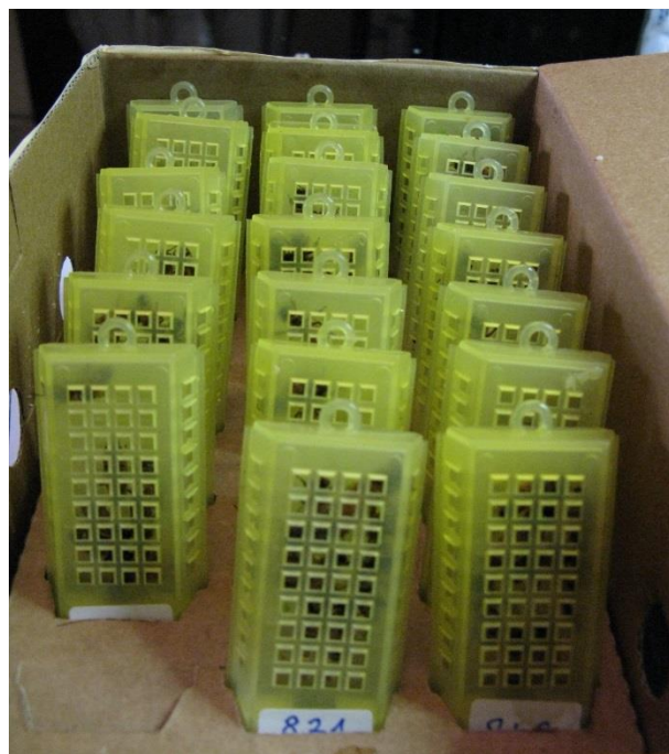
Figure 6. Honey bee queen of A. m. ligustica ready for shipping.

queens) from one region of Europe to another by beekeepers (De La Rúa et al. , 2009; Meixner et al. , 2010). Several subspecies of A. mellifera have been involved in this movement (figure 6). There is documentation at least from the 19 th century of how certain colonies of subspecies known to be particularly gentle or productive, or even because they are ‘aesthetically pleasing’, such as A. m. cypria , have been transferred from their area of origin to different regions of Europe (Canestrini,