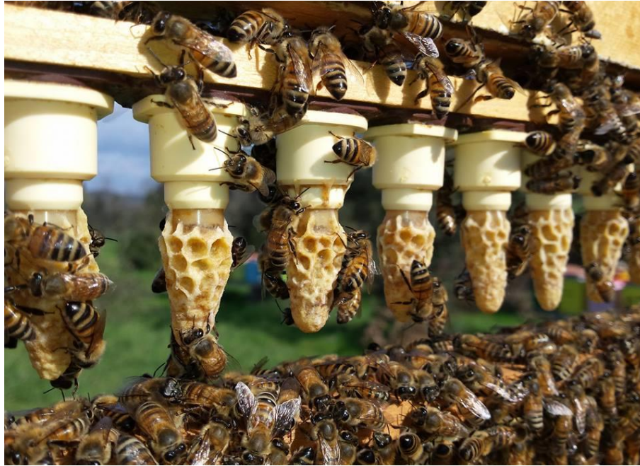
Figure 7. Honey bee queen cells obtained with the larvae grafting technique.

1899). The most striking cases, however, concern A. m. carnica and A. m. ligustica . A. m. carnica , has been introduced into vast regions of the natural distribution area of A. m. mellifera , in Central and Northern Europe, where it was preferred by beekeepers for its productivity and gentleness to the local A. m. mellifera ; in the last few decades this subspecies has also become widespread in some parts of Italy, especially in the North-East (Friuli Venezia-Giulia, Trentino Alto-Adige and Veneto regions) (Carpana et al. , 2006; Dall’Olio et al. , 2007), and according to anecdotal reports by beekeepers also in other parts of the country. A. m. ligustica , considered by many beekeeping experts to be the best honey bee for honey production, has spread to many parts of Europe and also to Sicily (where it risked almost completely replacing the local A. m. siciliana ) but also to the New World, where the black honey bee A. m. mellifera was initially introduced (Costa et al. , 2015). In Malta, there has recently been some concern regarding the conservation of the local endemic subspecies A. m. ruttneri , due to the introduction of A. m. ligustica and A. m. siciliana (Zammit-Mangion et al. , 2017).