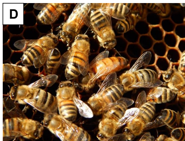
Figure 1. Queens and worker bees: 1A) A. m. ligustica , Isola Vicentina, Vicenza, Italy; 1B) A. m. siciliana , Palermo, Sicily, Italy; 1C) A. m. mellifera , Airole, Imperia, Italy; 1D) A. m. carnica × ligustica , University of Udine apiary, Udine, Italy.