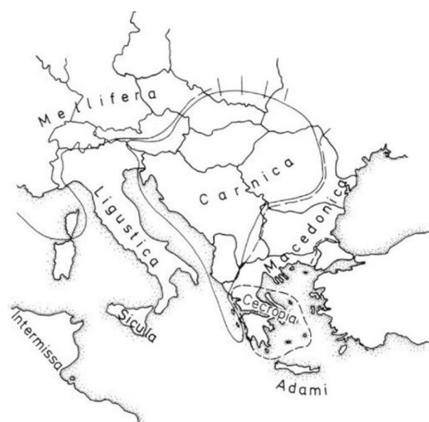
Figure 3. South-eastern Europe A. mellifera subspecies map, from Ruttner (1988).

In Italy, a unique case in Europe, there are natural populations attributable to 4 subspecies. A. m. ligustica (figure 1A) and A. m. siciliana (figure 1B) are endemic Italian subspecies; A. m. mellifera (figure 1C) and A. m. carnica (figure 1D), probably present only as populations crossbred to different degrees with A. m. ligustica . As regards the original distribution of honey bee subspecies in Italy, as well as Friedrich Ruttner's unsurpassed work 'Biogeography and Taxonomy of Honeybees' (Ruttner, 1988), we can refer to a previous Italian paper published in 1927 by Anita Vecchi, entitled: 'Sulla distribuzione geografica dell' Apis mellifica ligustica Spin. in Italia' (Vecchi, 1927). In this paper, Anita Vecchi analysed the chromatic patterns of numerous Italian populations, identifying honey bees with large clear bands in the first abdominal tergites in most of the peninsula, the presence of completely black honey bees in northern Italy and Sicily, and the presence of intermediate colours in certain areas. In the map presented by Anita Vecchi is reported the colour pattern distribution of Italian honey bee (figure 2). This distribution of A. mellifera subspecies in Italy, substantially confirmed by Ruttner's study, is well represented by the distribution map published in his above cited text (figure 3).