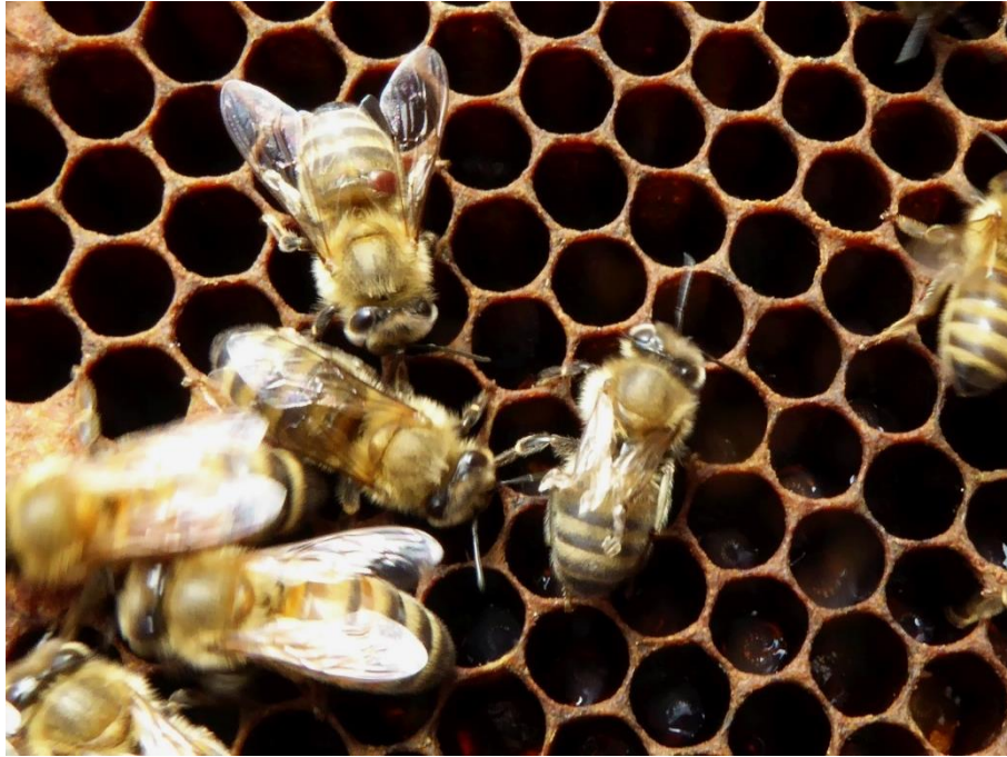
Figure 8. Worker honey bees with V. destructor mite and with symptoms of deformed wing virus (Photo by Paolo Fontana).

queen encounters only males that are related to each other, following the large-scale reproduction of selected queens, it is as if she had mated with a small number of males and polyandry will not achieve the expected results (Tarpy and Page, 2002).