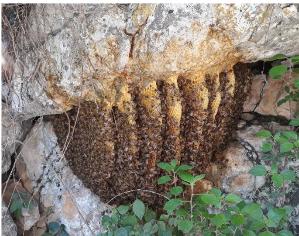
Figure 4. Wild honey bee colony from Morigerati, Salerno, Italy, September 2013 (Photo by Vincenzo Latriglia).

An Italian law issued in 1992 protects A. m. ligustica as a form of wildlife: “wildlife is a public asset of the State and is protected in the interest of the national and international community”. The fact that A. mellifera is divided into various indigenous subspecies at local level means that the subspecies, especially if they are endem-