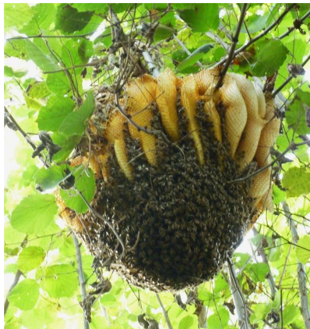
Figure 5. Feral honey bee colony in a mesophilic wood on the hills of Isola Vicentina, Vicenza, Italy; September 2013 (Photo by Damiano Fioretto).

1) The first, already known since ancient times, albeit to a lesser extent, is the moving of bees (colonies or