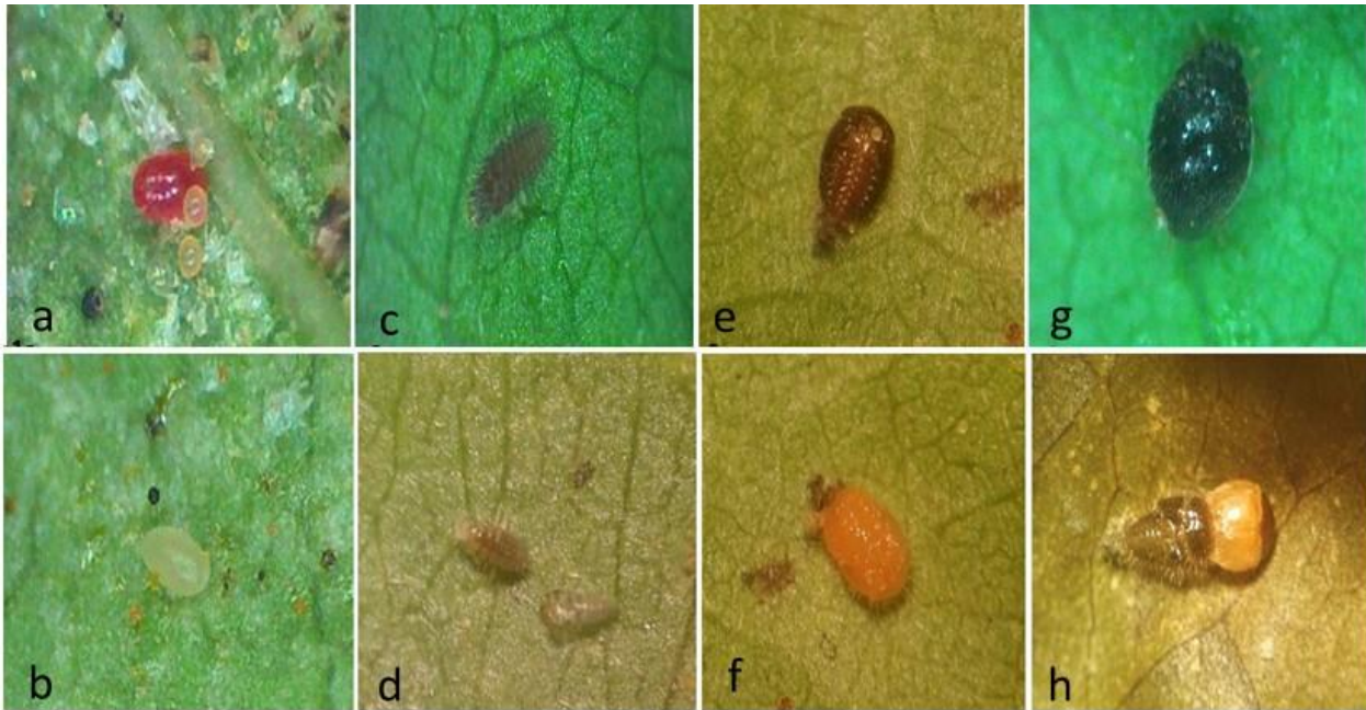
Figure 1. Stages of S. tridens development: (a-b) eggs; (c-d) larvae; (e-f) pupae; (g-h) adults fed T. bastosi on J. curcas leaves in the laboratory.

average of 12.35 days (table 1), and these results were similar to those obtained by Roy et al. (2002) for Stethorus punctillum (Weise) reared on Tetranychus mcDanieli McGregor.