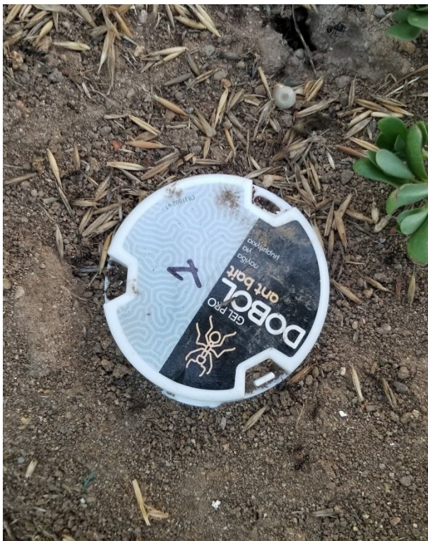
Figure 6. Photograph of site 1 from the 7:00 PM observation period on Day 11.