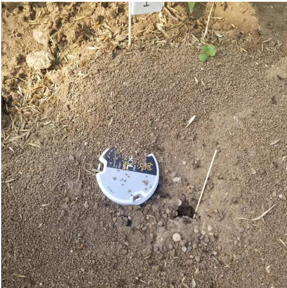
Figure 1. The last day of the control period of the experiment.

Supporting our observations that the ants built a barrier around the bait entrance are the results of turning the trap 90° (days 11-14). Figures 4 through 8 shows a sequence of photographs that when the trap is turned and the bait entrance opened, the ants began to plug the new opening with sticks, dirt, and rocks. A video showing the behavior of plugging an entrance is available at https://youtu.be/WNJUpdPpQyI .