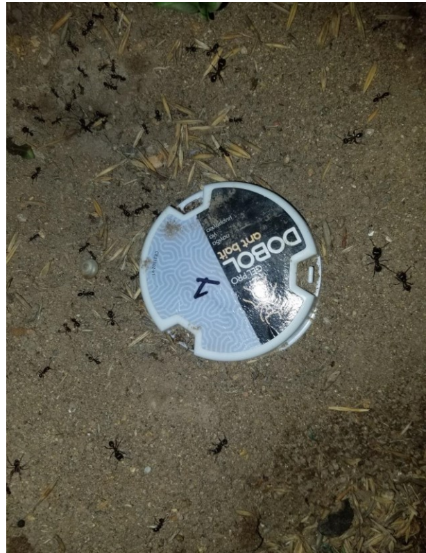
Figure 5. Photograph of site 1 from the 7:00 PM observation period on Day 10. This is the first photograph taken 12 hours after the new entrance was opened. Note the sticks being piled up in front of the entrance.