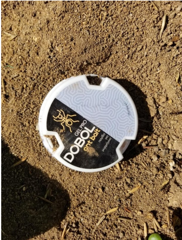
Figure 4. Photograph of site 1 on day 10, the first day the trap was turned 90°. Note that the opening to the right was previously plugged. The entrance to the bottom left will be opened.