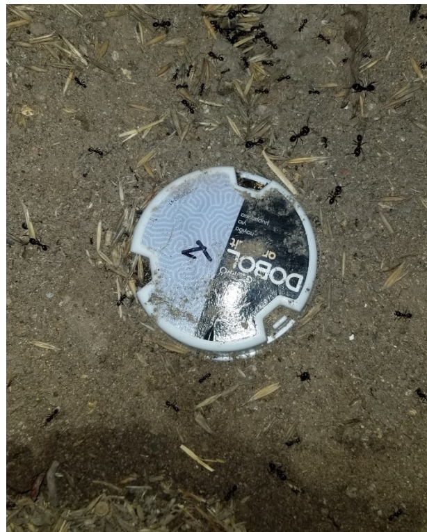
Figure 7. Photograph of site 1 from the 7:00 PM observation period on Day 12.