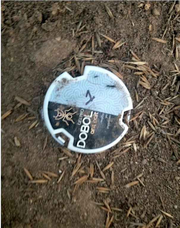
Figure 8. Photograph of site 1 from the 7:00 PM observation period on Day 13.

We would like to note that it was not feasible to provide any quantitative analysis of the photographs. The debris covering the entrances to the trap could not be weighed without disturbing the ants nor was it possible to control for the possibility that other organisms would visit the observation sites. Moreover, the photographs were taken under field conditions making it difficult to provide an accurate quantitative analysis because of shifting light conditions. The best we can offer are the photographs themselves and the video clip.