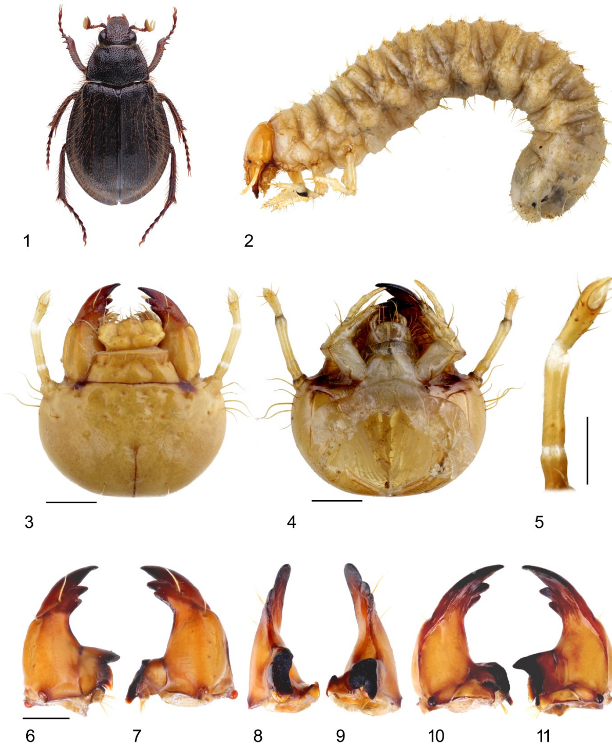
Figures 1-11. P. rattus . (1) Adult male, dorsal view. Third-instar larva 2-11. (2) Habitus, lateral view; (3) head, dorsal view; (4) head, ventral view; (5) left antenna, dorsal view; 6-11 mandibles; (6) left, dorsal view; (7) right, dorsal view; (8) left, medial view; (9) right, medial view; (10) right, ventral view; (11) left, ventral view. Scale bars: 3-4 = 1 mm; 5-11 = 0.5 mm.

Antennae (figures 3-5): apparently 3-segmented (antennomeres III + IV fused) Relative length of antennomeres: II > III + IV > II. Antennomeres III + IV nearly as long as II; antennomere I more than twice as short as antennomere II. Antennomeres I and II without sensory spot and setae. Ultimate antennomere with one large apically joined membranous sensory spot on ventral and